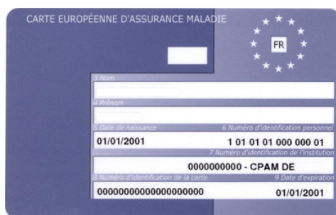
European health insurance card