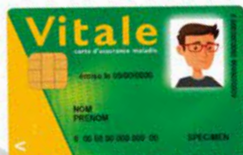
French health insurance card